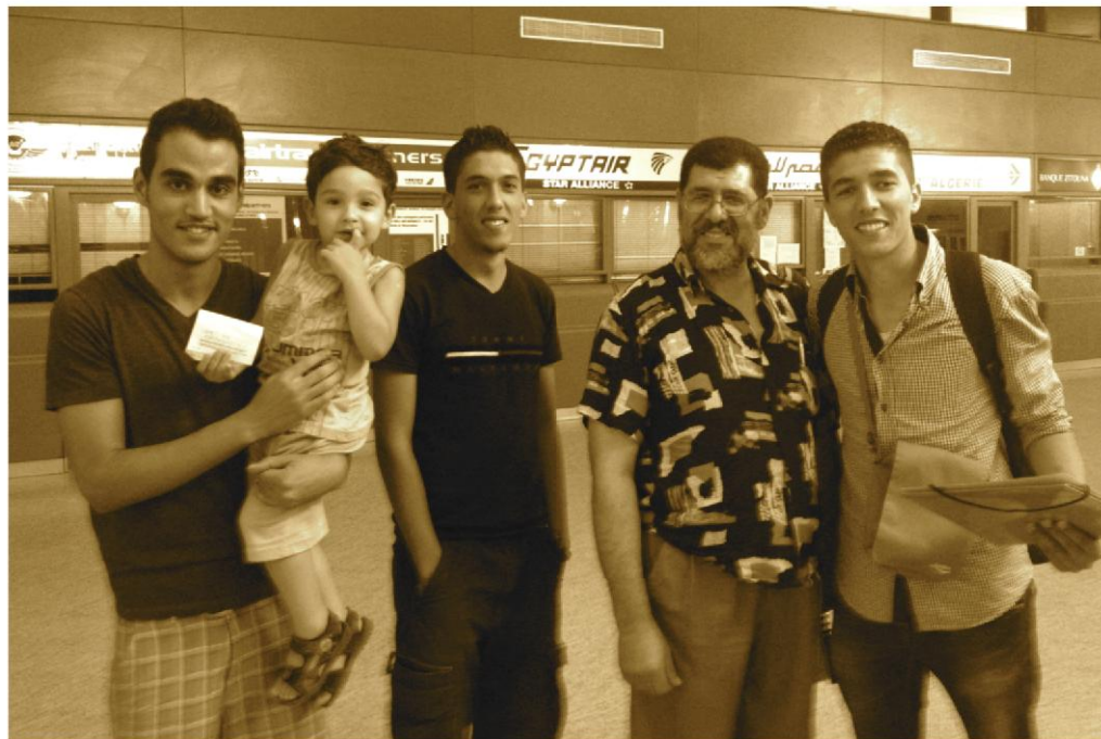
Thomas Jefferson Scholars Bid Farewell to Their Families