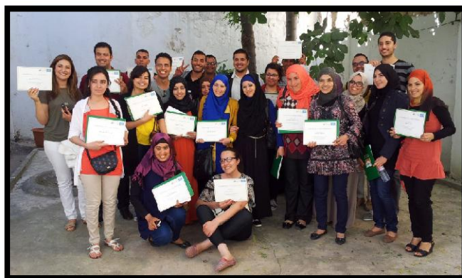
Proud graduates of the Grant Writing Seminar